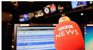
BBC Journalism Apprenticeship