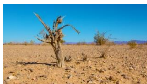
New Climate Change Degrees