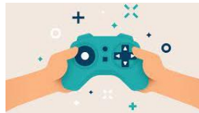
Gaming on the School Curriculum?